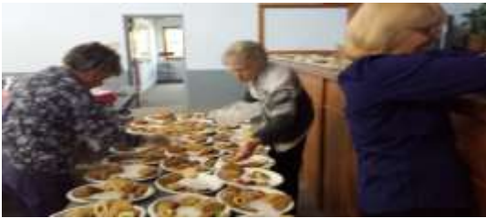
Ladies setting up cookies for the tables