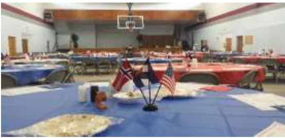
The tables are set!