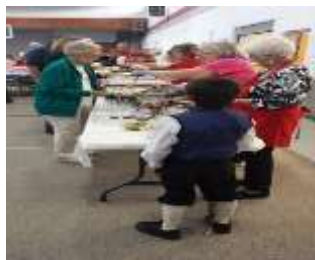
The Serving Line