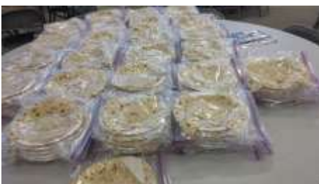
That's a LOT of Lefse