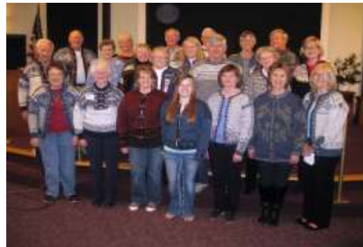
Stein Fjell Lodge "Sweater Night" 2015