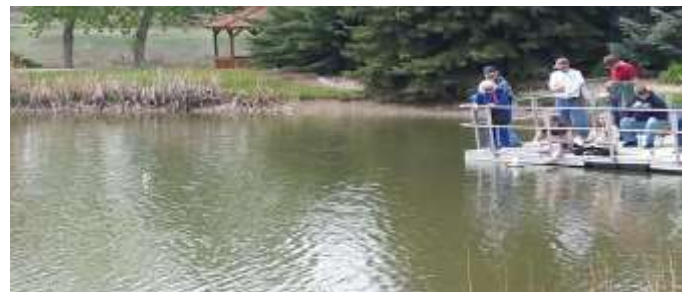
Sailing the Sloop's