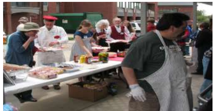
In line, waiting to enjoy our wonderful food!!