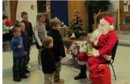
Santa meets the kids