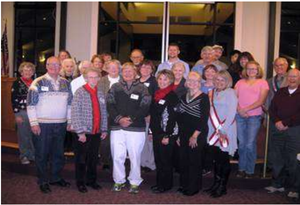
Our new Officers for Stein Fjell 2015