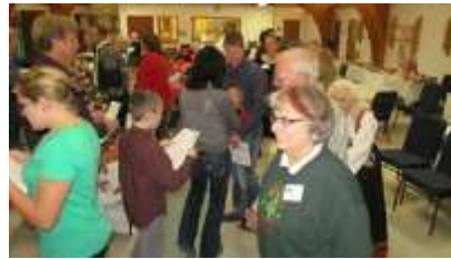
Around the Christmas tree