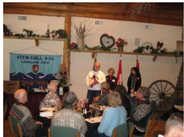
A quick memorial service for members and family lost last year.