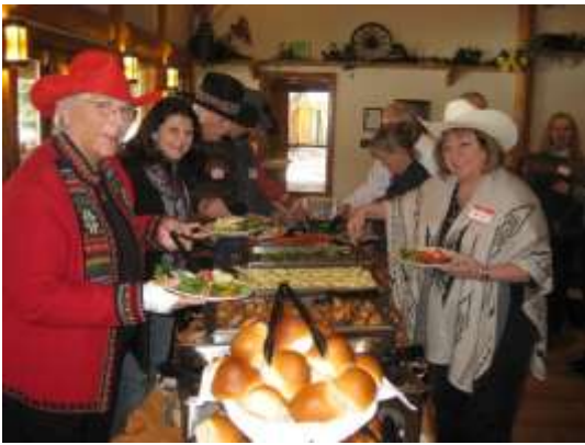
In the food line with Western dressed members