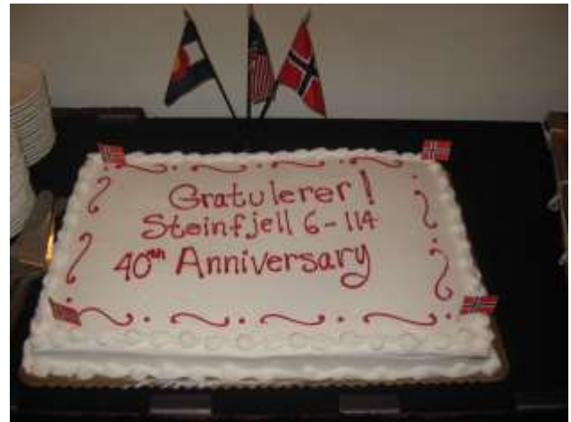
Our delicious cake